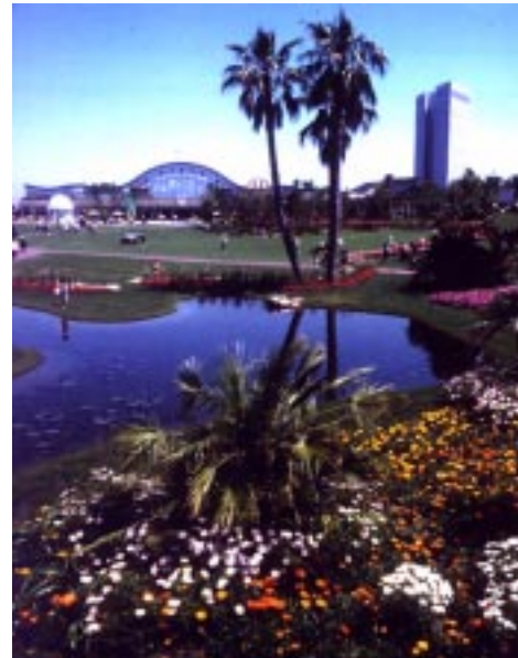
Yume-Hana Kan (Dream and Flowers Pavillion) and Hotel

In 2000 the 17th National Urban Greenery Fair is to be held in Tochigi prefecture from September 9 to November 5.