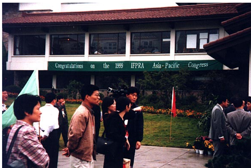
Delegates assembling outside the National Tea Museum, Hangzhou - the main venue for congress sessions

by different segments of the population. Delegates also visited many different parks, landscapes and cultural areas that have made Hangzhou, and surrounds, one of the leading tourist areas in China.